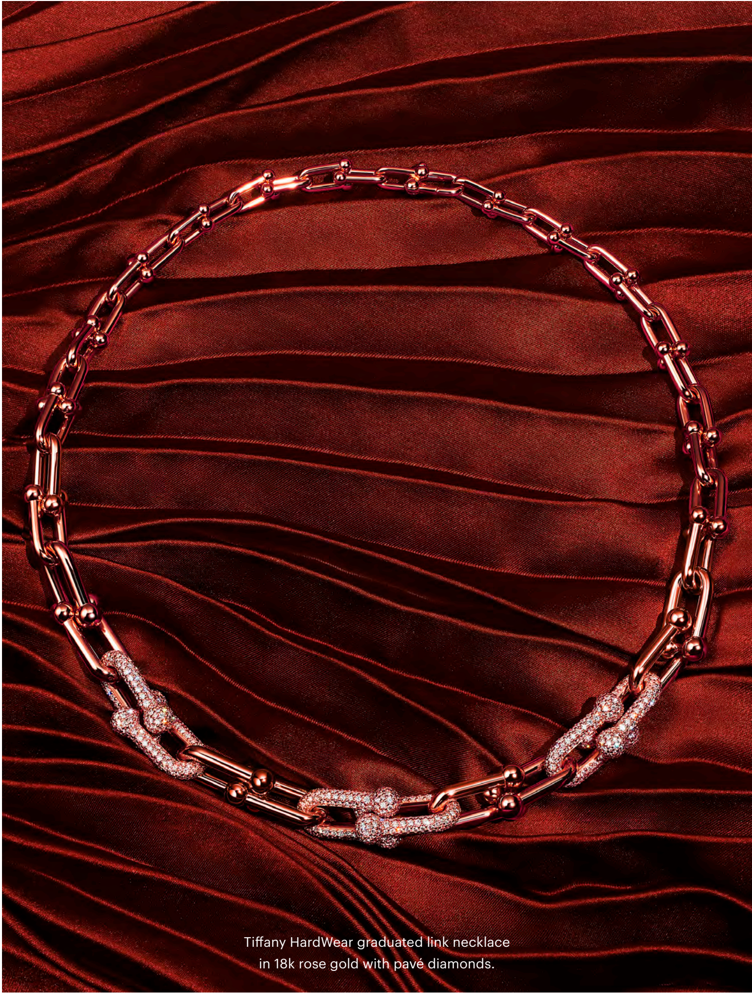
Tiffany HardWear graduated link necklace in 18k rose gold with pavé diamonds.