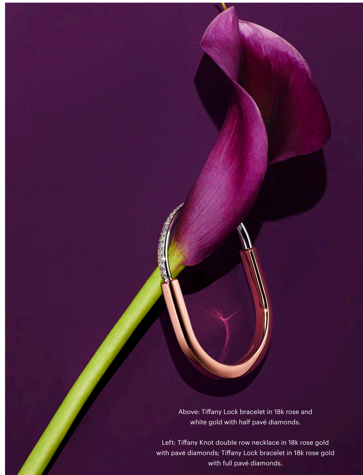
Above: Tiffany Lock bracelet in 18k rose and white gold with half pavé diamonds.