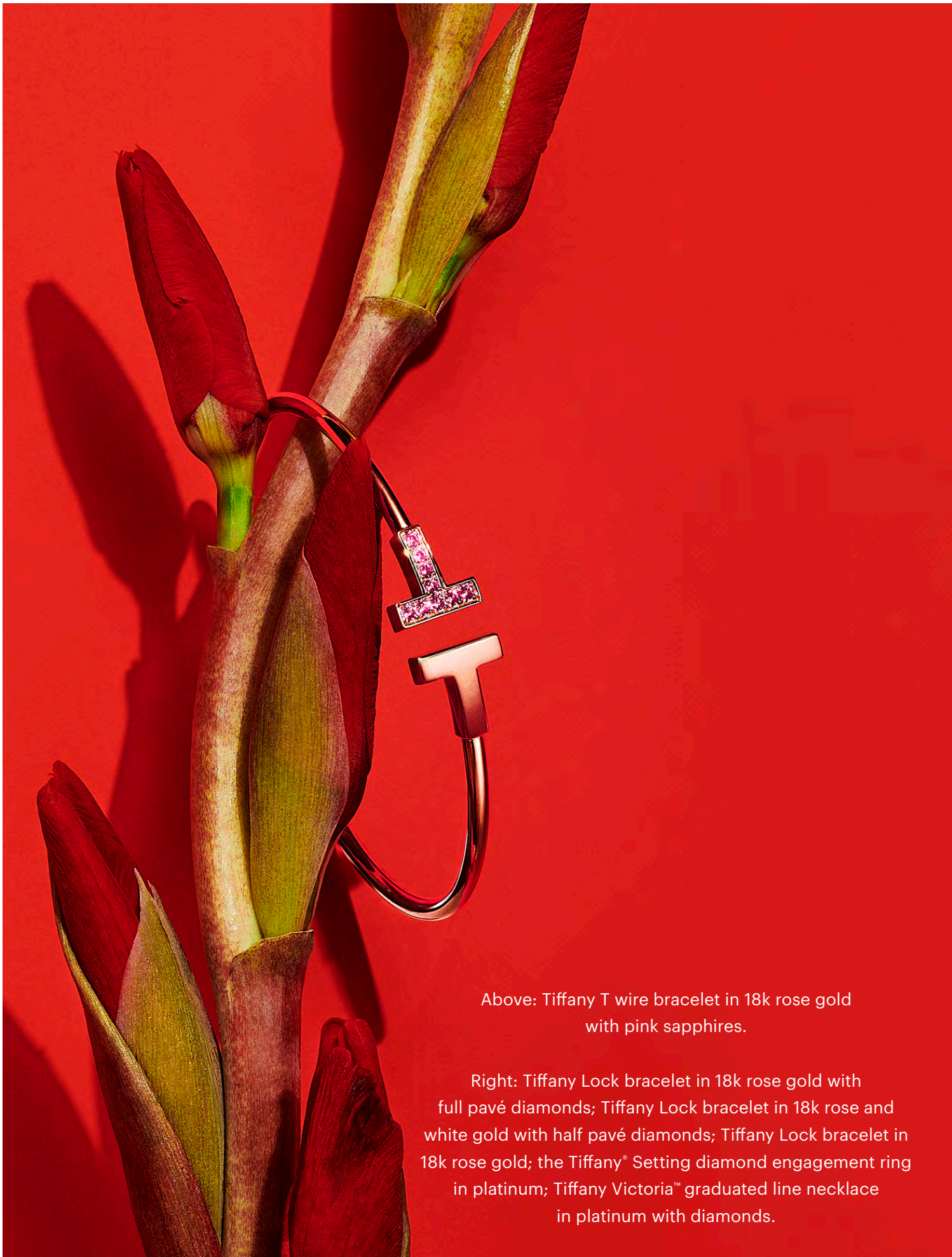
Above: Tiffany T wire bracelet in 18k rose gold with pink sapphires.