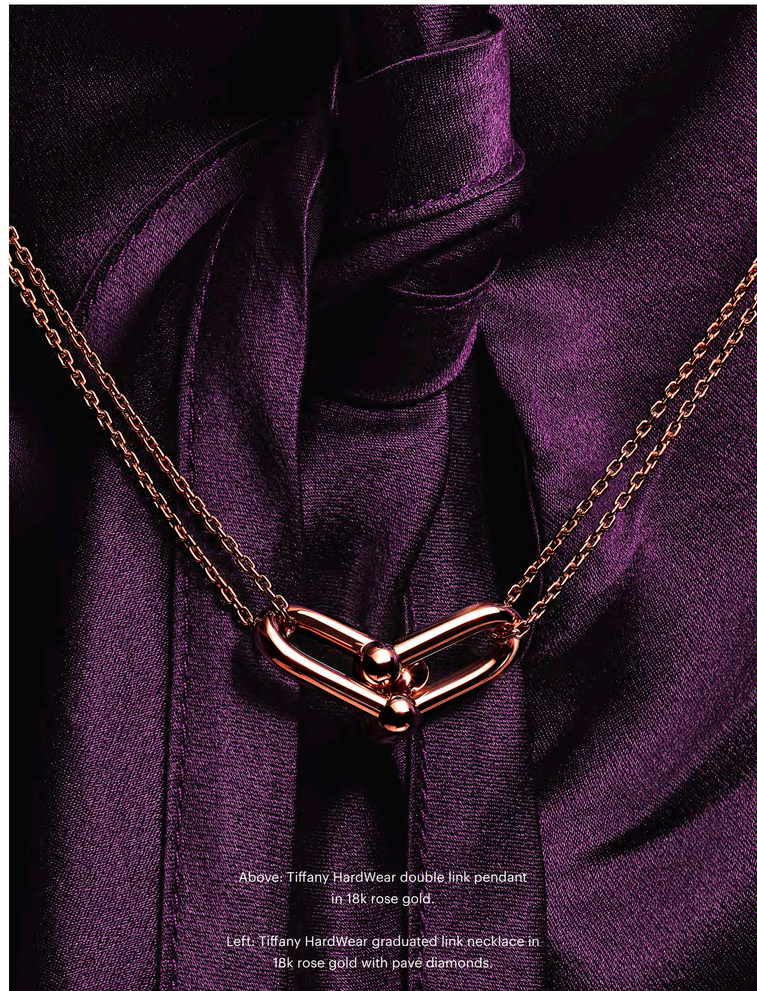
Above: Tiffany HardWear double link pendant in 18k rose gold.