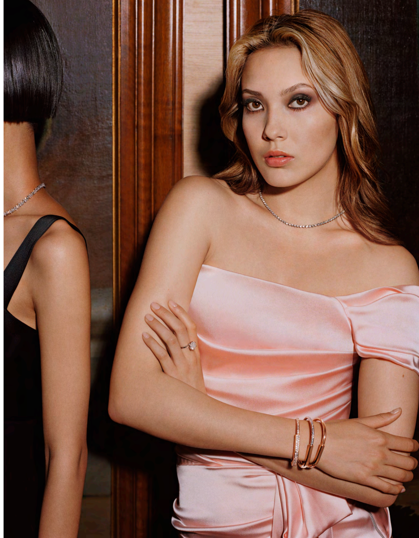
Right: Tiffany Lock bracelet in 18k rose gold with full pavé diamonds; Tiffany Lock bracelet in 18k rose and white gold with half pavé diamonds; Tiffany Lock bracelet in 18k rose gold; the Tiffany® Setting diamond engagement ring in platinum; Tiffany Victoria™ graduated line necklace in platinum with diamonds.