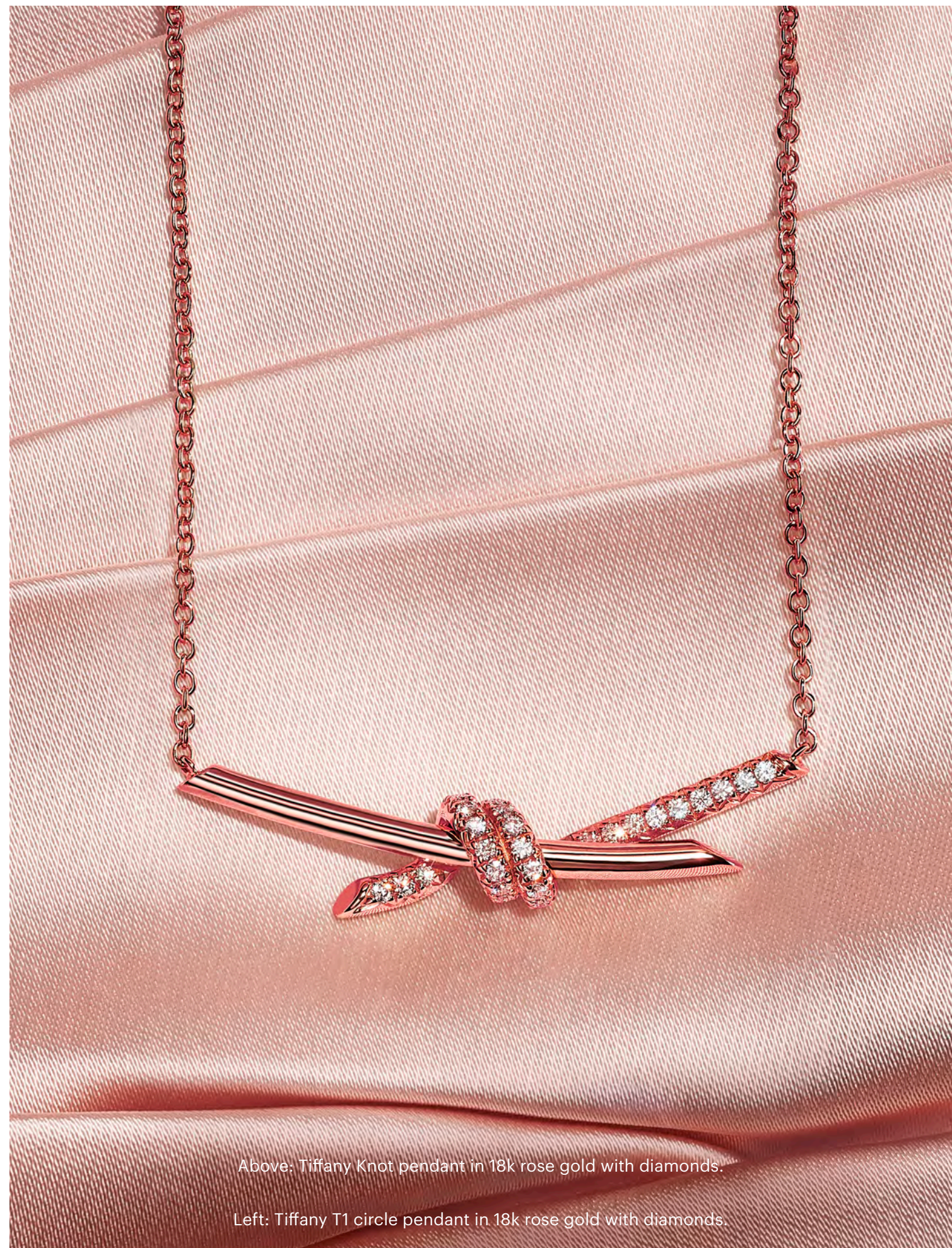
Above: Tiffany Knot pendant in 18k rose gold with diamonds.