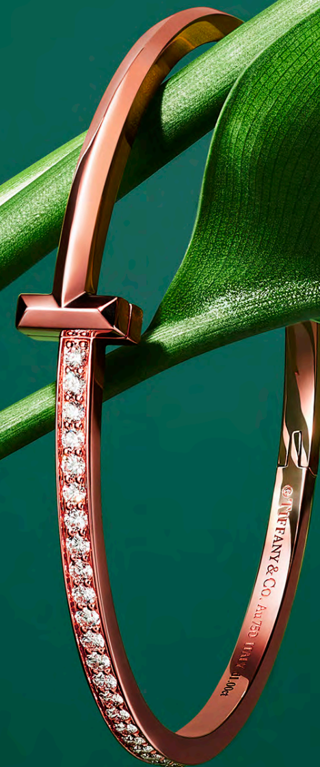
Tiffany T1 narrow hinged bangle in 18k rose gold with diamonds.