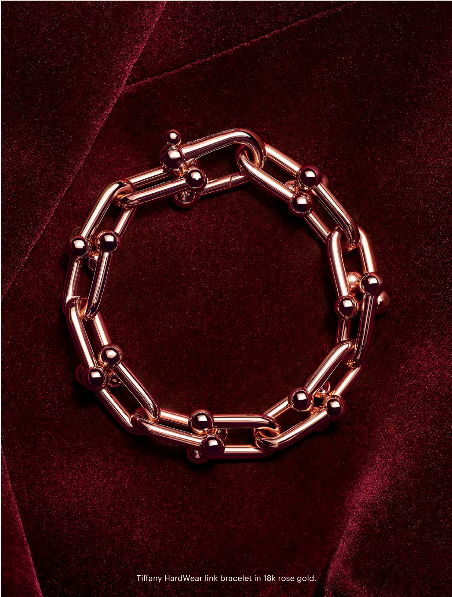
Tiffany HardWear link bracelet in 18k rose gold.