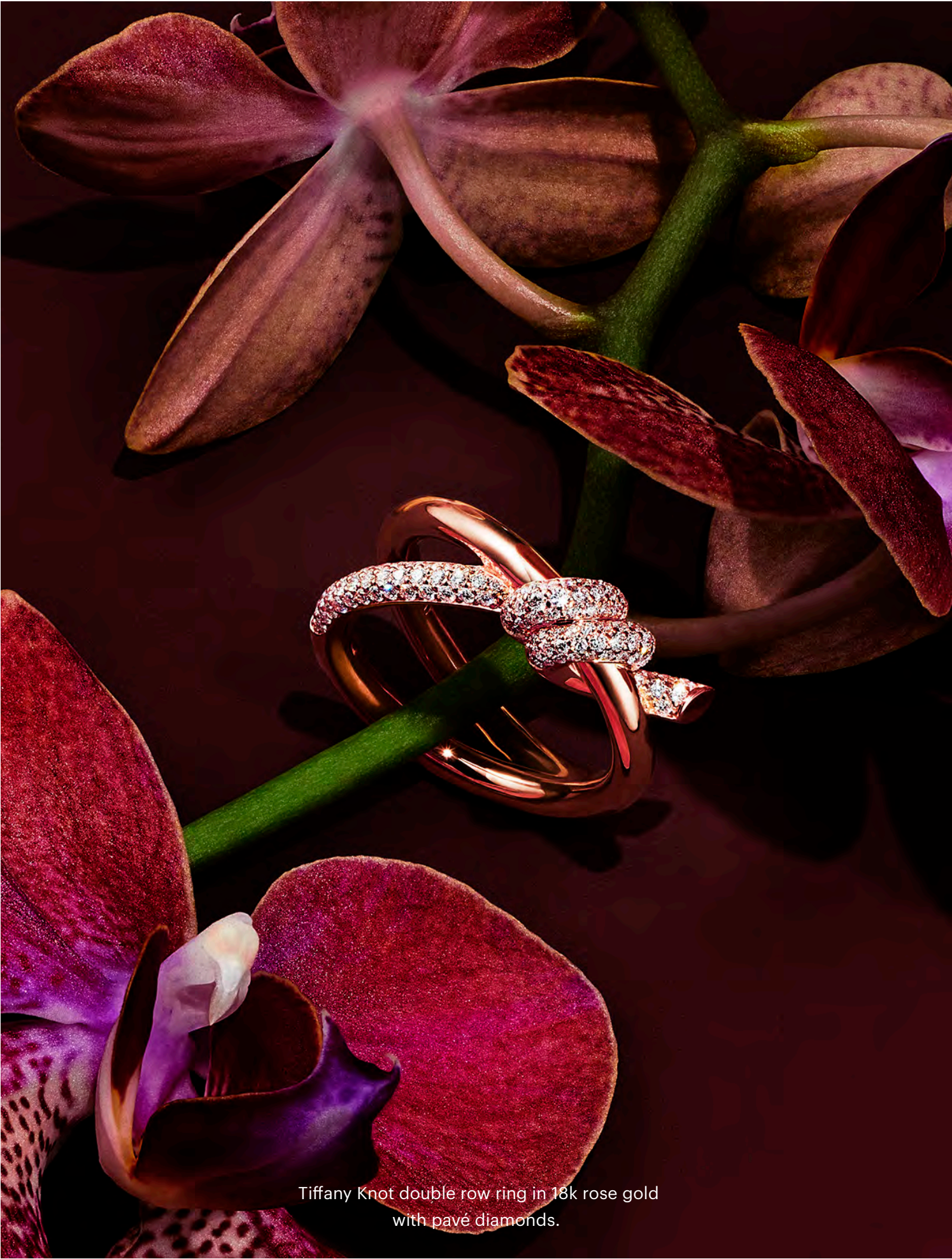
Tiffany Knot double row ring in 18k rose gold with pavé diamonds.