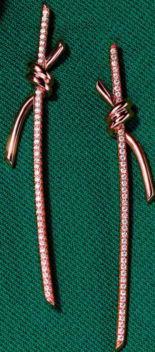
Tiffany Knot drop earrings in 18k rose gold with diamonds.